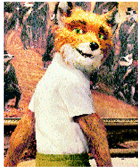
On your holiday movie preview: "Fantastic Mr. Fox," sci-fi, detectives and vampires. 3