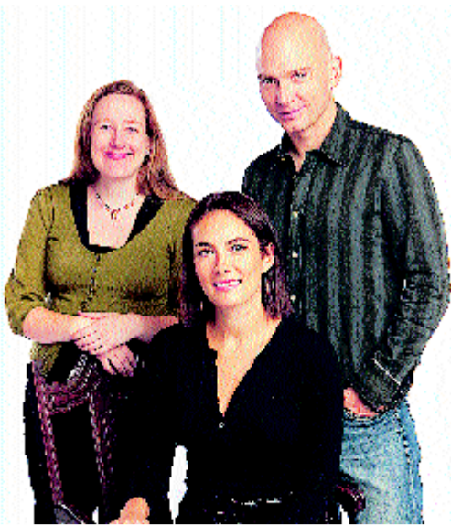
Playwright Sarah Ruhl, left, has let her imagination run all the way to Broadway 4