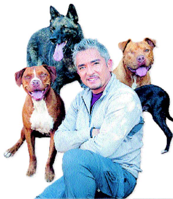
Cesar Millan will be figuratively taking the pulse of North Jersey's dog owners.