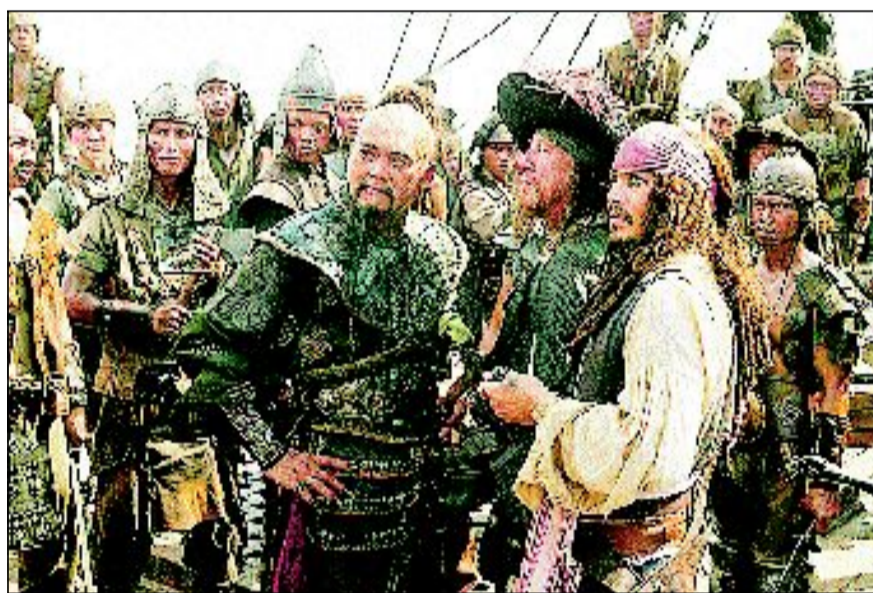
"Pirates of the Caribbean: At World's End"