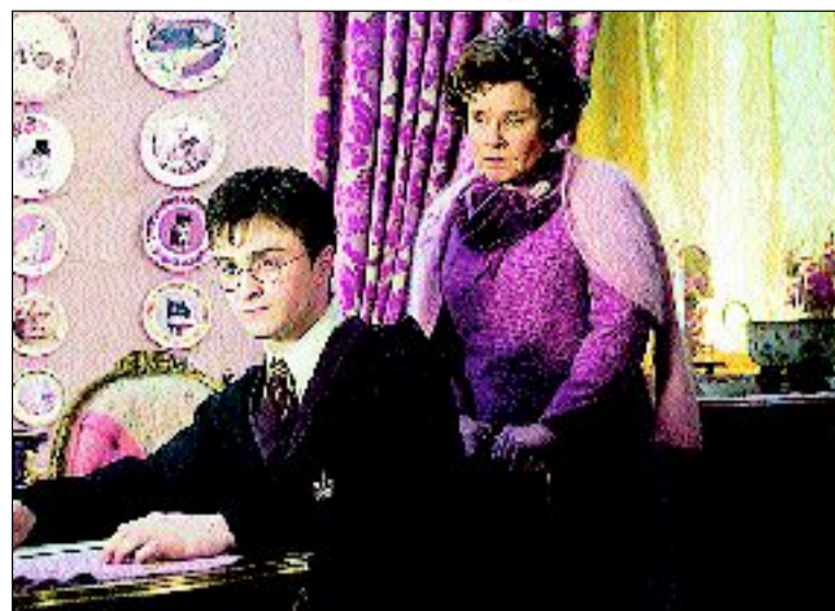
"Harry Potter and the Order of the Phoenix"

July 13: What else can you say about Harry? This movie is sure to be a bit darker, scarier and more frightening, just as J.K. Rowling's book is. Look for your favorite actors — Daniel Radcliffe, Rupert Grint and Emma Watson — to be casting their magical spells and working wonders during the suspenseful adventure. You'll also see lots more battling, as the wizards need to defend themselves against the powers of You-Know-Who. The rating is not yet official but is expected to be PG-13. Check out www.Harrypotterorderofthephoenix.com for more information and trailers.