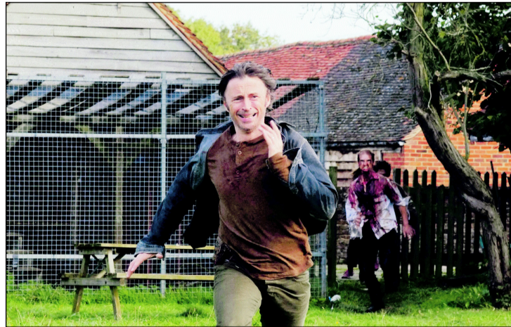
Special to the Herald News

"Weeks" is a frenetic killing machine – illogical, telling in its grasp of human nature and utterly incapable of embracing the humanity it wants to show us.